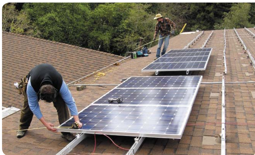
The Lord's work: Workers install part of the 17 kW PV system at the St. John's Episcopal Church in Oakland, California.