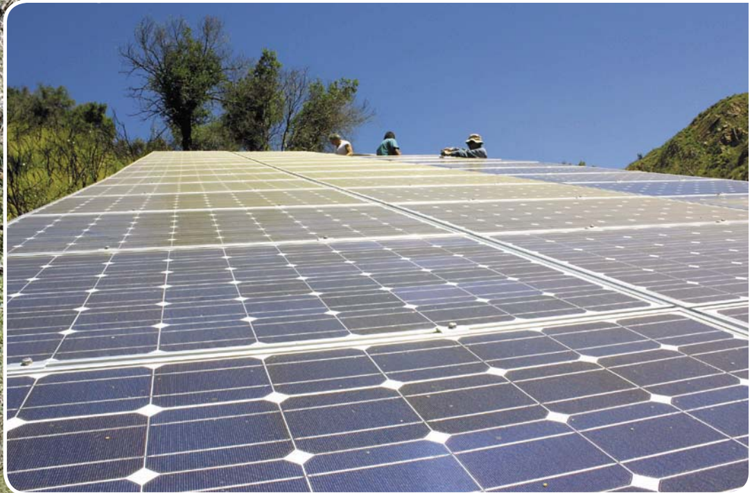
Looking upwards: The 21 kW solar system at the Tassajara Zen Mountain Center is located 90 m above the compound's buildings.

Obviously, living far away from the power grid has been a driver of solar installations for a long time, so its remote location instantly made Tassajara a good candidate for photovoltaics (PV). But logistics and practicality aside, the impulse to utilize the power of the sun to meet the electricity needs at the Zen retreat was driven largely by the religion's philosophy and worldview. »Our ethos is to live lightly on the earth. The way it expresses itself is in our relationship with the environment